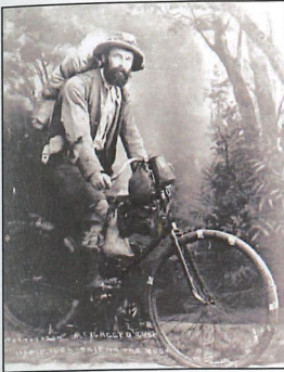
Cycling to & from the gold rushes. Note the tyre patches caused mostly by doublegees