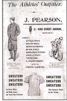
Cycling fashion in late 19th century