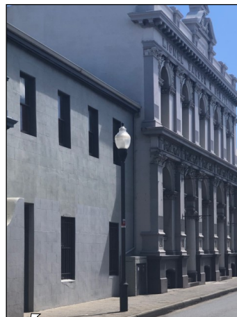
Entry to building # 31